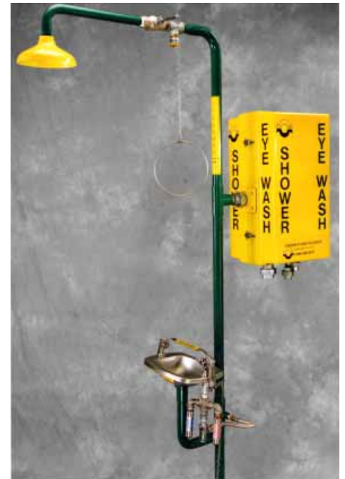
NOTE: Therm-O-Mix Station does not include shower or eyewash components.

Level 4: (V-4) Heat sensor valve V-4 opens and equalizes pressure on the high and low pressure side of the V-3 diaphragm control valve preventing steam flow if outlet water is above design temperature.